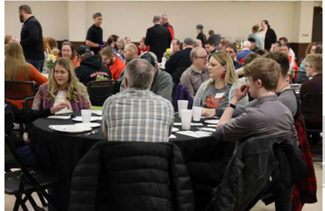
Patricia A. Kreutz Memorial Scholarship recipients and parents.